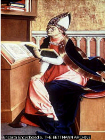
Figure 1 Saint Augustine (354-430)

And so the cycle is complete. The limits placed on reason made room for faith. But in fact the cycle simply started anew once more. Religious skepticism directed against the Christian religion gives rise to Christian Philosophy, much as skepticism directed against the Greek mythological religion generated pagan Philosophy. For example, the fourth-century Christian Philosopher, St. Augustine, responded to religious skepticism about the literal truth of the Genesis creation story by substituting a quite different belief. God did not create the world at any point in time. There never was a time before creation when the world was not. In creating the world God created the entire temporal order.