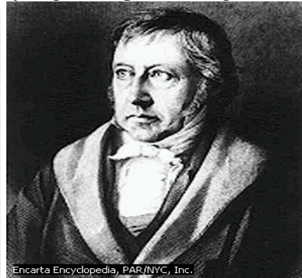
Encarta Encyclopedia, PAR/NYC, Inc.

A total philosopher may of course chose to repudiate religion whenever its assertions are found to be false on the basis of philosophy. But a total philosopher is not obliged to repudiate religion. For there are different ways of judging non-philosophical beliefs from a philosophical point of view.