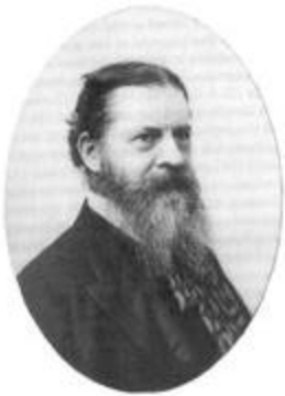
Charles Saunders Peirce (1839-1914)

Belief in objective truth, as the American philosopher Charles Saunders Peirce held, conditions the very possibility of our search for truth. This belief is not initially justified as an objective truth, but as an assumption whose adoption makes the pursuit of such truth possible. Of course this pursuit may ultimately be justified by its fruit. It may come to be justified by the errors it succeeds in eliminating. The pragmatic justification of the assumption of objective truth may pass into theoretical justification of it only to the extent that science comes up with actual cases of objective truth.